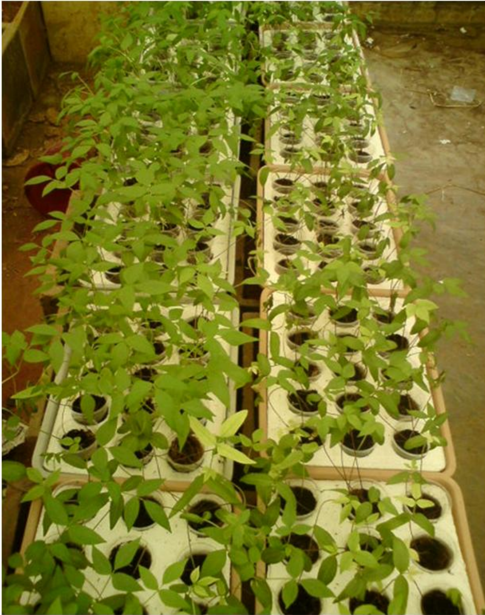
Fig. 2. Response of blackgram seedlings to T 3 and T 2 on 18 DAS