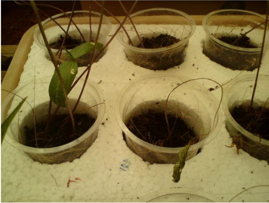
Fig.3. Response of the susceptible blackgramseedlings (RU-8-708) to salinity