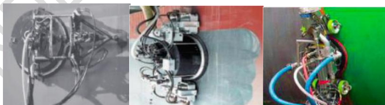
• Figure 1: Various cleaning robots