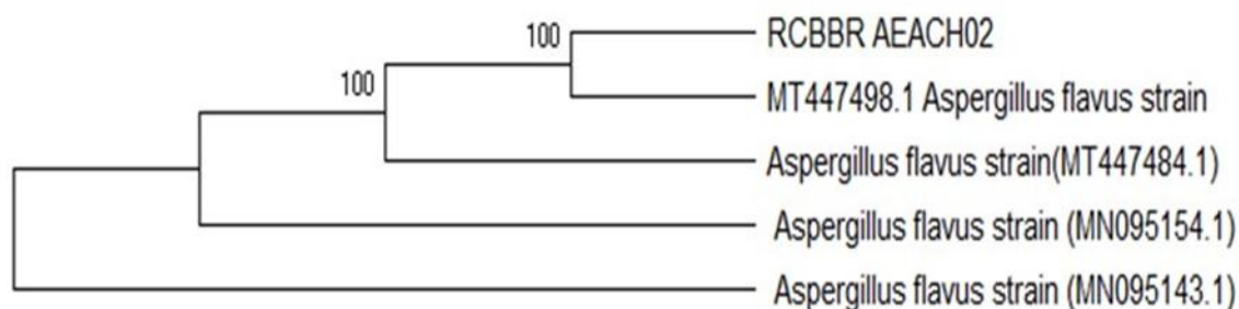
Fig. 2: Phylogenetic tree of A. flavus .

NAME: Aspergillus flavus . Strain: RCBBR_CH3. Accession NO: ON584559