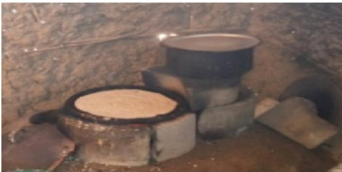
Fig. 2 Harari stove

Harari stove is promoted in ECC-SDCOH (Ethiopian Catholic Church Social and Development Coordinating Office of Hararghe) implementation areas. The main gradient used for the production of injera in the Hararghe area is sorghum flour which makes storage of injera difficult for more than two days. Therefore, households bake injera every day to feed their family fresh injera .