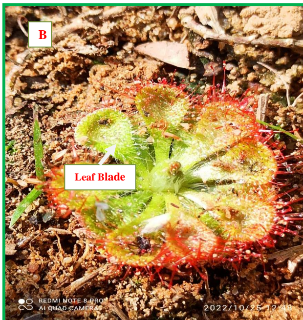
Fig 1B- Mohan Range- Kusmi