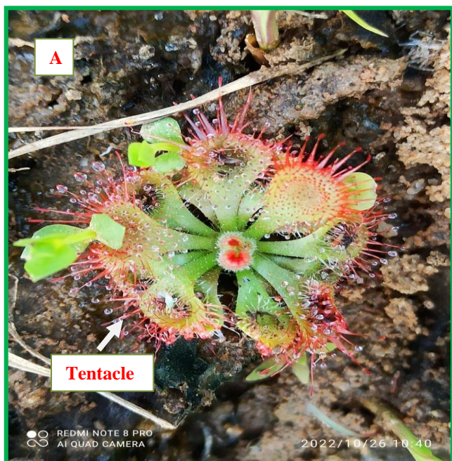
Fig 1A- Bastua Range-Near Umradi River