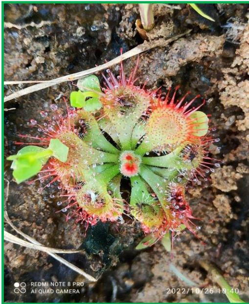
Photograph 1 - Bastua Range-Near Umradi River