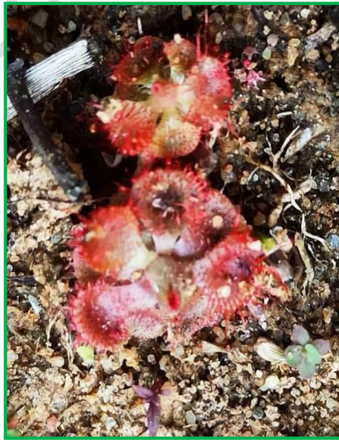
Photograph 4 - Pondi Range

Comment [HK16]: Without the accompanying comments and their correspondence in the text, the illustration or photograph in a scientific article would be worthless.