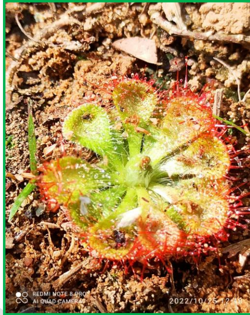
Photograph 2 - Mohan Range- Kusmi