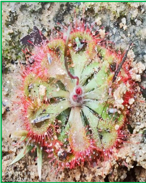
Photograph 3 - Dubri Range- Near Banas River