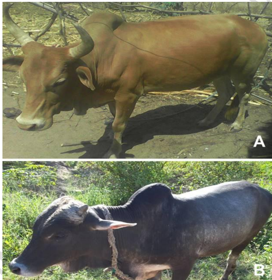
Fig.2. A photograph of Tanzania Short Horn Zebu from Bunda (A) and Ukerewe (B) Districts

The results for the partial correlations among the various physical body measurements are presented in Table 4. In all cases the correlations were positive. Body weight and heart girth correlated significantly ( P < 0.01 ) to all physical body measurements except ear length and muzzle circumference. Among the physical measurements under the study, withers height correlated significantly ( P < 0.01 ) to all except body length which correlated significantly ( P < 0.05 ) to all the physical measurements except ear length, muzzle circumference and hock circumference. Ear length correlated significantly to muzzle circumference and hock circumference and non-significantly ( P > 0.05 ) to horn length and tail length, while horn length correlated significantly ( P < 0.05 ) to muzzle circumference and hock circumference and non-significantly ( P > 0.05 ) to tail length. Tail length correlated significantly ( P < 0.05 ) to muzzle circumference and hock circumference. There was also a significant ( P < 0.05 ) correlation between muzzle circumference and hock circumference.