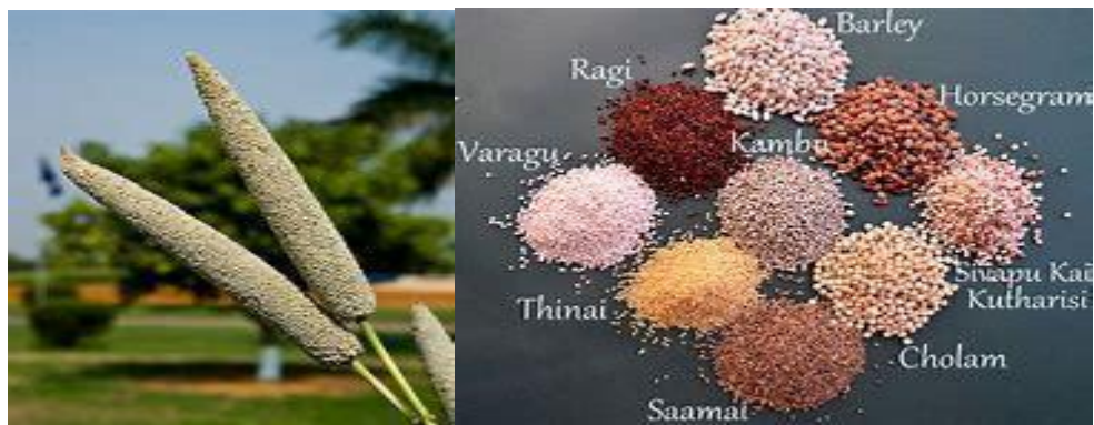
Fig.1. Millets grown in India

Noodles were ancient staples in many countries. Nearly 4000 years old. China introduced a pot of thin noodles comparable to la-Mian, Chinese noodles developed through stretching and hand-pulling the dough (Lu et al 2005). Technological advances, eating habits, health consciousness, regional diversity of raw material, and flavour preferences have changed the formulation of noodles, over the time making them the world's most popular snack. Noodles can be produced from wheat, rice, potato-starch, pulses, millets, and other grains. Raw noodle quality is determined by colour, appearance, and processing. Sheeting and cutting machines make noodles from wheat flour, millets, pulses, water, and salt. Noodles must taste, feel, and look excellent. Noodles need gluten and wheat flour with strong starch swelling and pasting capabilities (Fu 2008).