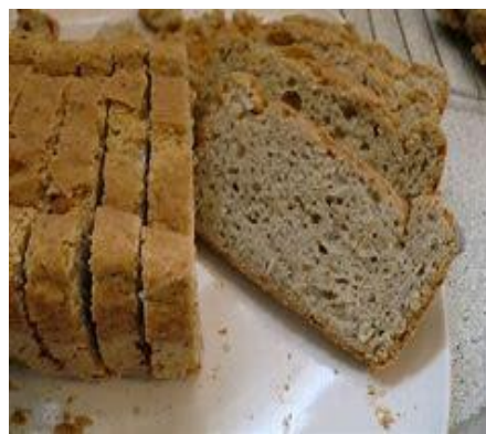
Fig. 3. Millet bread

Bread is made by mixing flour, water, oil, salt, and yeast into dough and baking it into a loaf. IIMR (Indian Institute of Millets Research) makes millet pieces of bread by replacing 50% wheat flour with pearl millet flour, finger millet flour, or foxtail millet flour of and adding the yeast, trans-fat free oil, salt, and sugar. Bread was prepared from proofed dough. Buns were prepared from dough balls (Fig 3).