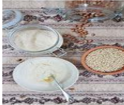
Fig. 2. Sorghum porridge

eat products, health consciousness, product benefits, and the launch of diverse oat-containing producers drive the market (Anderson and Bridges 1993; Wrick 1993; 1994; Stark and Madas 1994). The change from dairy products to oat milk will define global growth.