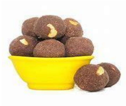
Fig. 5. Finger millet laddus