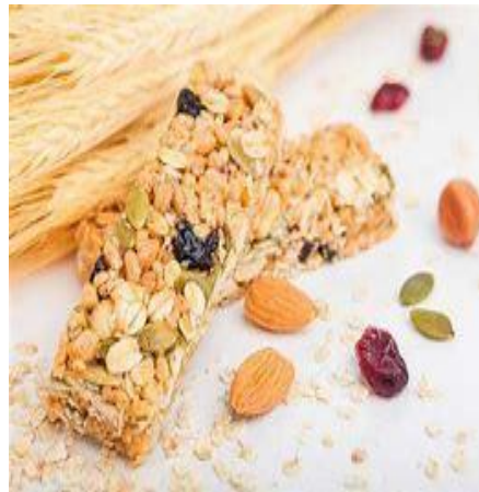
Fig. 6. Sorghum energy bars

Sorghum flakes and broken flakes add energy bars. Bran is carefully pulverised and dried to remove moisture. Honey syrup was added to bind and sweeten bran and flakes. It provides clean energy (Fig. 6).