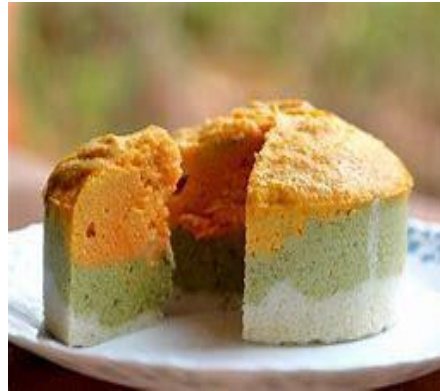
Fig. 4. Barnyard millet cake

Cake is made by blending flour, sugar, fat, eggs, and flavourings into dough and baking it. At IIMR (Indian Institute of Millets Research), millet cakes are made with 100% pearl millet flour, finger millet flour, or foxtail millet flour, high-quality vegetable oil, sugar, eggs, and chocolate or vanilla essence. out of all, Finger millet cake was best (Fig. 4).