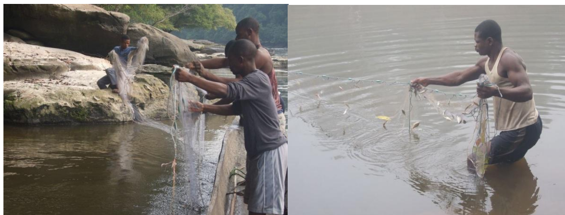
Fig. 2. Capture of fish in the rivers of Lomami National Park and its hinterlands

10% formalin to stop the digestion process postmortem. Samples were then transported to laboratory of Hydrobiology and Aquaculture, University of Kisangani for further processing.