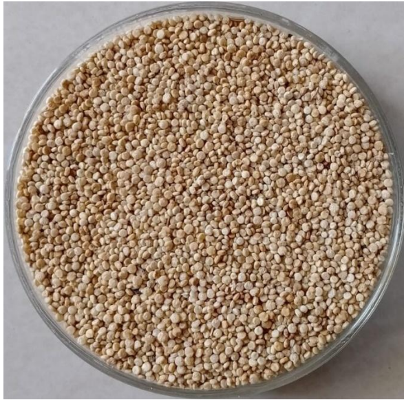
A: Raw Quinoa