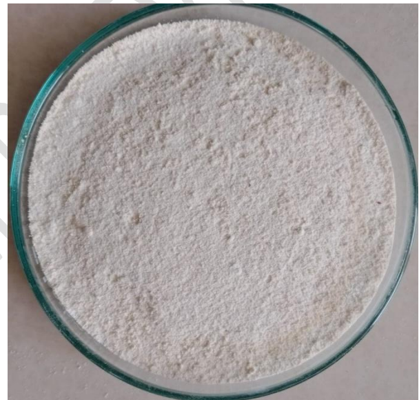
D: Quinoa Flour