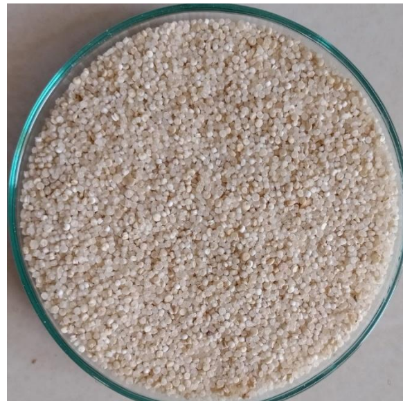
Figure 2: Quinoa Recovery