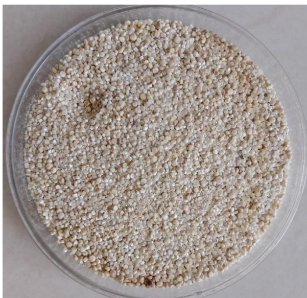
Figure 3: Broken Quinoa