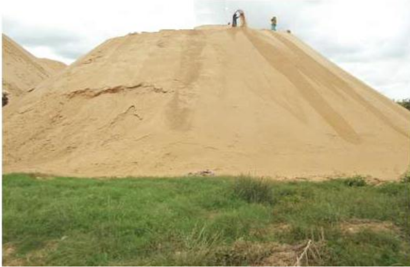
Fig. 1. Graphic picture of rice husk mill in Edda rice mill.

The utilization of renewable energy in Ebonyi State is still done either at a very low scale or by primitive methods. Researchers have established recently the potential of the rice husk and sawdust for generating biogas for domestic and industrial applications, and even for export if expanded on a large scale [4, 5]. Utilization of this waste for biogas production will help to reduce the over-reliance on wood fuel and fossil fuel for domestic energy needs, leading to a reduction in environmental pollution and greenhouse gas emissions and consequently climate change. Electric energy can be generated from rice husk (RH) & sawdust through various methods. In the case of this study, the gasification method would be adopted based on its multi-benefits and most environmentally friendly. The system is designed in such a greener way to ensure absolute zero-emission. Okedu, et al [6] proposed the potential of small hydropower in contributing as one of the off-grid options in Nigeria.