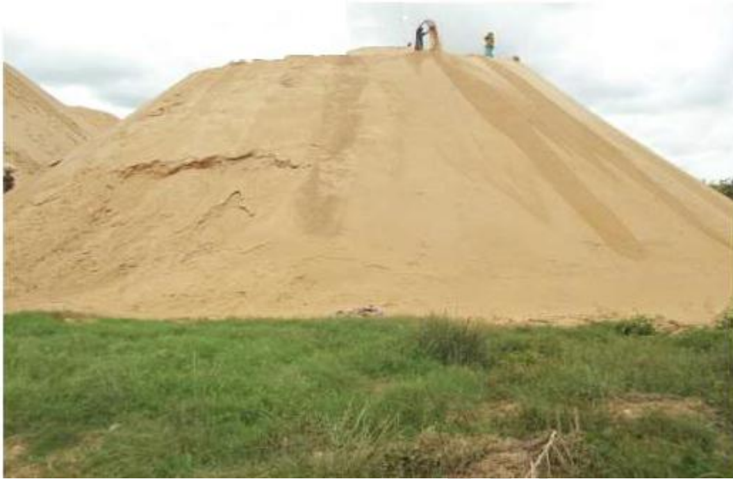
Figure 1. Graphic picture of rice husk mill in Edda rice mill.

The utilization of renewable energy in Ebonyi State is still done either at a very low scale or by primitive methods. Researchers have established recently the potentials of the rice husk and sawdust for generating biogas for domestic and industrial applications, and even for export if expanded on a large scale [4], [5]. Utilization of these waste for biogas production will help to reduce the over-reliance on wood fuel and fossil fuel for domestic energy needs, leading to a reduction in environmental pollution greenhouse gas emission and consequently climate change. Electric energy can be generated from rice husk (RH) & sawdust through various methods. In the case of this study, gasification method would be adopted based on its multi-benefits and most environmentally friendly. The system is so designed in such a greener way to ensure absolute zero-emission. Okedu, et al [6] proposed the potential of small hydropower in contributing as one of the off-grid options in Nigeria.