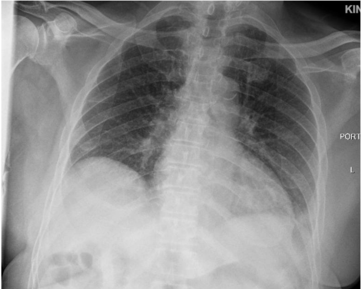
Fig.3. Chest X Ray

Chest X Ray showed Possible mild left-sided pleural effusion and left basilar lung infiltrate or pneumonia. Echocardiogram showed Normal left ventricular systolic function with Ejection fraction of 60-65% with Mild aortic and tricuspid regurgitation. Duplex imaging, color doppler and spectral analysis was performed on bilateral carotid system demonstrating no evidence of hemodynamically significant disease.