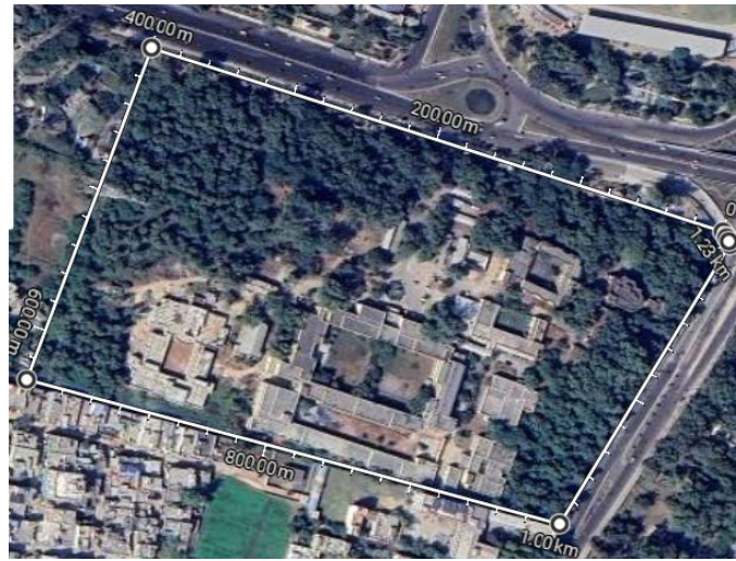
Figure 1: Satellite map of JDB Govt. Girls College campus showing dense vegetation.