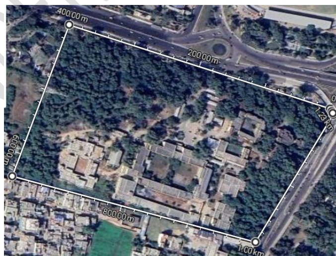
Figure 1: Satellite map of JDB Govt. Girls College campus showing dense vegetation.

The city experiences cold winters and warm summers, with a temperature ranging from a maximum of 48^{\circ}\text{C} to a minimum of 9^{\circ}\text{C} . It receives very little rainfall throughout the year with an average of around 728 mm per year. The city has witnessed extensive urbanization over the years, with a number of high-rise buildings, corporations, and industries.