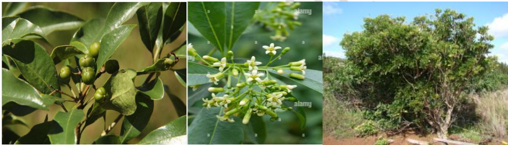
Pittosporum viridiflorum Sims. var. viridiflorum (S.L.)