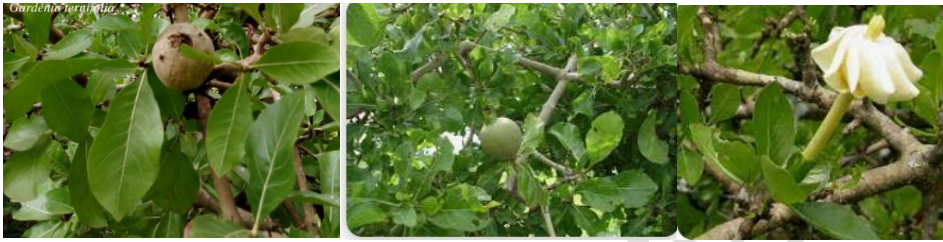
Gardenia ternifolia Schum. & Thonn.

Appendix I: Photos of Gardenia ternifolia Schum. & Thonn., Pittosporum viridiflorum Sims. var. viridiflorum (S.L.) and Phytolacacododecandra L. Herit