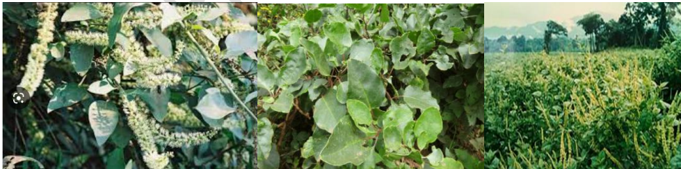
Phytolacacododecandra L. Herit