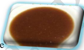
Fig 2: Wood apple sauce

From the local market wood apples were collected during the season and they were stored in deep freezer for the further study. For the preparation of products ingredients were procured from local market.