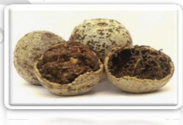
Fig 1. Woodapple fruit.

“Many underutilized fruits and vegetables are rich in micronutrients and could significantly contribute to nutritional security if eaten as a part of daily diet. Common name for Woodapple ( Limonia acidissima Linn) is Bael. India is the native place for wood apple and is also cultivated in Bangladesh, Pakistan and Sri Lanka” (Bakshi et al. , 2001). “Fruit is, 5 to 12.5 cm wide, shape is oval to round, woody, amazingly hard rind which is difficult to crack, greyish-white, scurfy rind about six mm thick, pulp brown, mealy, odorous, resinous, astringent, acid or sweetish, with numerous small, white seeds scattered through it. Two types of wood apples are available, one with small, acidic fruits and the other with large, sweet fruits” (Morton and Julia 1987).