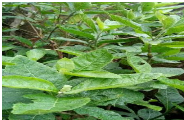
Fig. 1: Picture of Vernonia amygdalina Delile

worms ( Toxocara canis ) and also in vivo using experimentally infected dogs (puppies infected with Toxocara canis ) according to the method of Adams et al. , (2023).