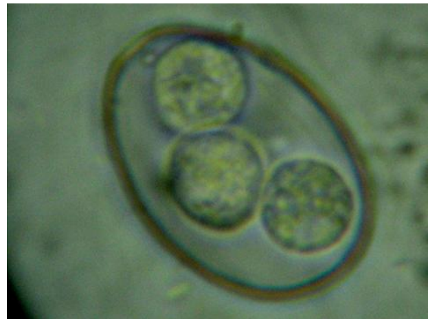
Fig 2: Eimeria tarabaie (n.sp.) (Sporulated)