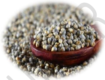
Fig 1. Pearl Millet ( Pennisetumglaucum )

Diabetes mellitus is moreover recognized as diabetes a crew of metabolic troubles which are characterised by capability of way of immoderate (high) blood sugar diploma hyperglycemia over an extended measurement of time [1,2]. Worldwide, the incidence of diabetes is projected to extend from 2.8% in 2000 to 4.4% in 2030 [3,4,5]. It would perchance in addition be projected that the quantity of diabetic victims will prolong to over 366 million cases in 2030 [6]. It has been specific understood that a diabetic sufferers glucose diploma (levels) rises exponentially previous the common range after a meal it is in addition real that the extent of their blood glucose unexpectedly decreases when the physique struggles to hold the