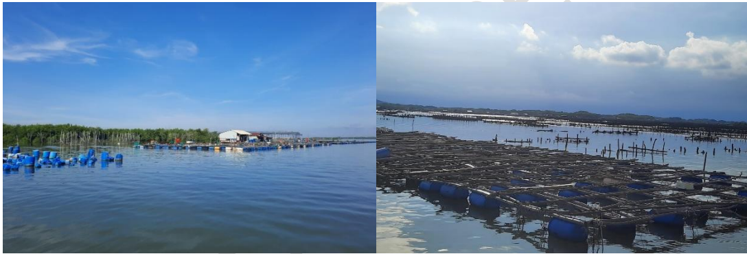
Figure 3: Some types of marine aquaculture in Ba Ria – Vung Tau

In Ba Ria-Vung Tau, coastal aquaculture encompasses a diverse array of forms and practices, reflecting the region's rich aquaculture landscape (Table 1). These practices include shrimp farming in ponds, spanning from super-intensive farming to improved extensive farming, and innovative approaches like shrimp farming combined with mangrove planting. Moreover, the region embraces oyster culture through methods such as raft, longline, and rack oyster culture, as well as cage farming for fish, lobster, and mollusks (Figure 3). Although coastal aquaculture planning has been in place since 2021, the developmental process has revealed inadequacies in various aspects, including farming areas, methods, techniques, breeds, food, waste management, and environmental sustainability. This has led to conflicts both within the aquaculture sector and with other industries, particularly concerning the allocation of coastal space. In light of these challenges, the application of a SWOT analysis in coastal aquaculture becomes crucial, enabling the identification of key issues that need resolution and the formulation of strategies for the sustainable development of aquaculture within localized coastal areas.