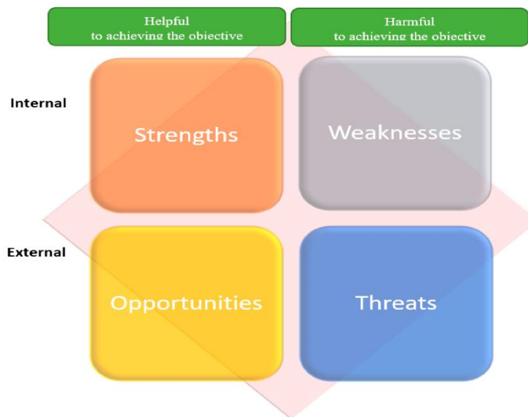
Figure 1. Strengths, weaknesses, opportunities, and threats (SWOT) analysis framework for aquaculture (adapted from [20])

To conduct a SWOT analysis involving aquaculture, data were collected from the interviews and then organized into a SWOT framework (Figure 1). A SWOT analysis serves as a structured framework for evaluating the internal and external factors that impact on an aquaculture industry or organization [19]. By systematically assessing the strengths, weaknesses, opportunities, and threats, stakeholders can gain a holistic understanding of the current state of affairs and formulate informed strategies for the future. In the case of Ba Ria-Vung Tau's aquaculture industry, this analysis supports identifying areas where the sector excels and where requires improvement. Furthermore, it will also pinpoint opportunities for expansion and areas of vulnerability that demand attention.