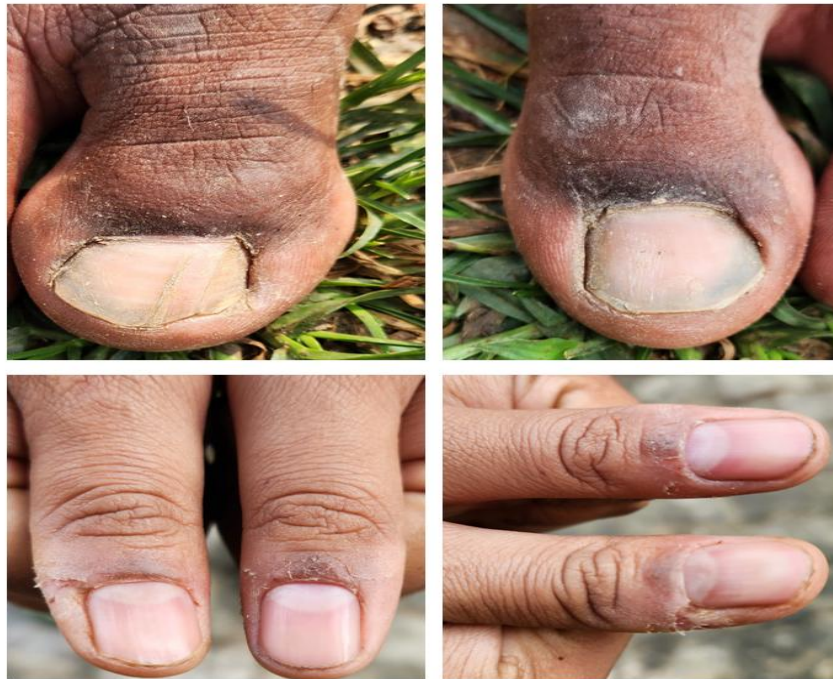
Fig.2 Chronic Paronychia.

present. Painless paronychia which develops in medical professionals or patients infected with mycobacterium TB, is a kind of paronychia associated with tuberculosis (TB). There have also been reports of onychodystrophy with tubercular Painless paronychia, infection of the distal phalanx resulting in contiguous involvement of the PNF, and Chronic Paronychia linked to TB verrucosa cutis. Another uncommon form of cutaneous leishmaniasis is paronychia(10).