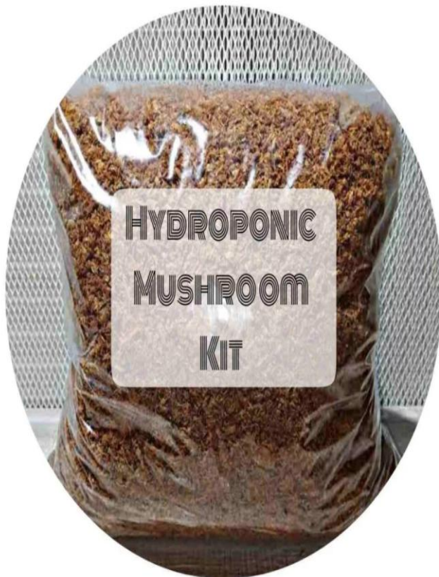
Fig 2Hydroponic Mushroom Growing Kit (Photo: Spore Emporium) http://www.vigyanvarta.com/

When the mushrooms are at their largest and right before the caps open, harvest them. Slice a mushroom at the center of the stem using a sharp knife or pair of scissors. A few mushroom growing kits have the potential to yield several mushroom flushes. For more harvests, follow the directions included with the package. If there are no more flushes, you can dispose of the spent kit by following the directions on the package or by composting it for future harvests. You can dispose of the used kit according to the directions or compost it if there will be no further flushes. If your kit is made to be reused, clean and keep it carefully till it's timeto use it anew. Follow the cleaning recommendations provided by the manufacturer. Recall