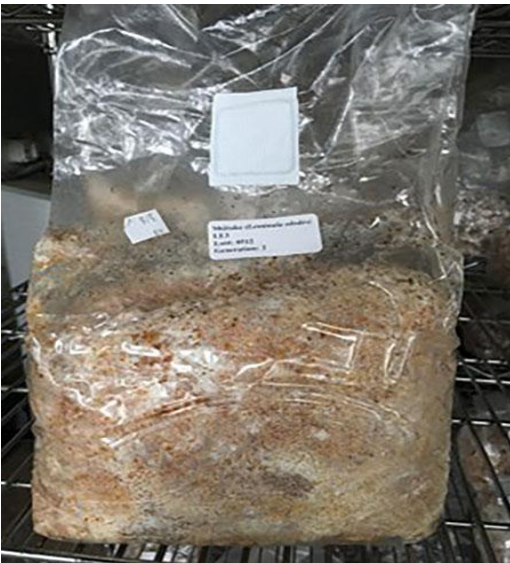
Fig1: Shiitake sawdust spawn (Photo by Rachael Martin, North Spore.) https://ohioline.osu.edu/factsheet/f-0040

Mycelium Growth and Spawning: The web of thread-like structures known as hyphae that make up mycelium growth is the first stage of the life cycle of a mushroom. The breakdown and uptake of nutrients are handled by the mycelium. In conventional mushroom culture, sawdust (Fig 1) or straw are common substrates on which mycelium is cultivated. By utilizing fertilizer-enriched substrates or liquid nutrient solutions, hydroponic systems provide an alternative. Mycelium must be introduced to a fruiting substrate in the next step; this changeover can be accomplished in hydroponic systems by moving the substrate that has been inoculated with mycelium to trays or containers that provide the necessary environmental controls, like humidity and temperature control. (Woo-Sik Jo et al., 2009)