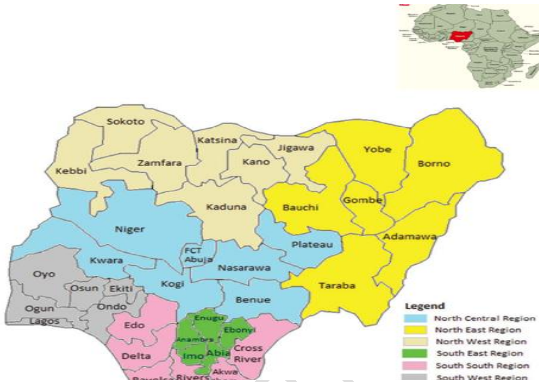
Figure 1: Map of Nigeria showing the Regions with insert of Map of Africa.