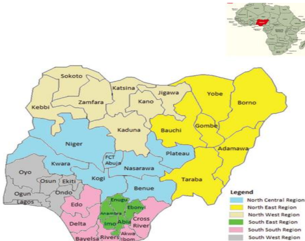
Figure 1: Nigeria Geopolitical Map.