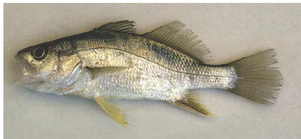
Figure 2. Bobo croaker fish ( Pseudotolithus elongatus ) from Lower Buguma Creek.

from each fish species was performed in accordance with the methodology specified in [15]. A volume of 18 mL of concentrated nitric acid was introduced per weighed fish muscle, and the resulting mixture was elevated to 100°C on a hot plate contained within a fume shroud chamber. A few droplets of analytical-grade hydrogen peroxide were introduced until the absence of brown emissions was detected. In 50 mL volumetric containers containing digested fish sample solutions, each solution was filtered individually through Whatman 0.42 µm filter paper before being filled to the mark with distilled-deionized water. Following this, the filtrate was transferred to 50 mL pre-cleaned plastic vials using acid.