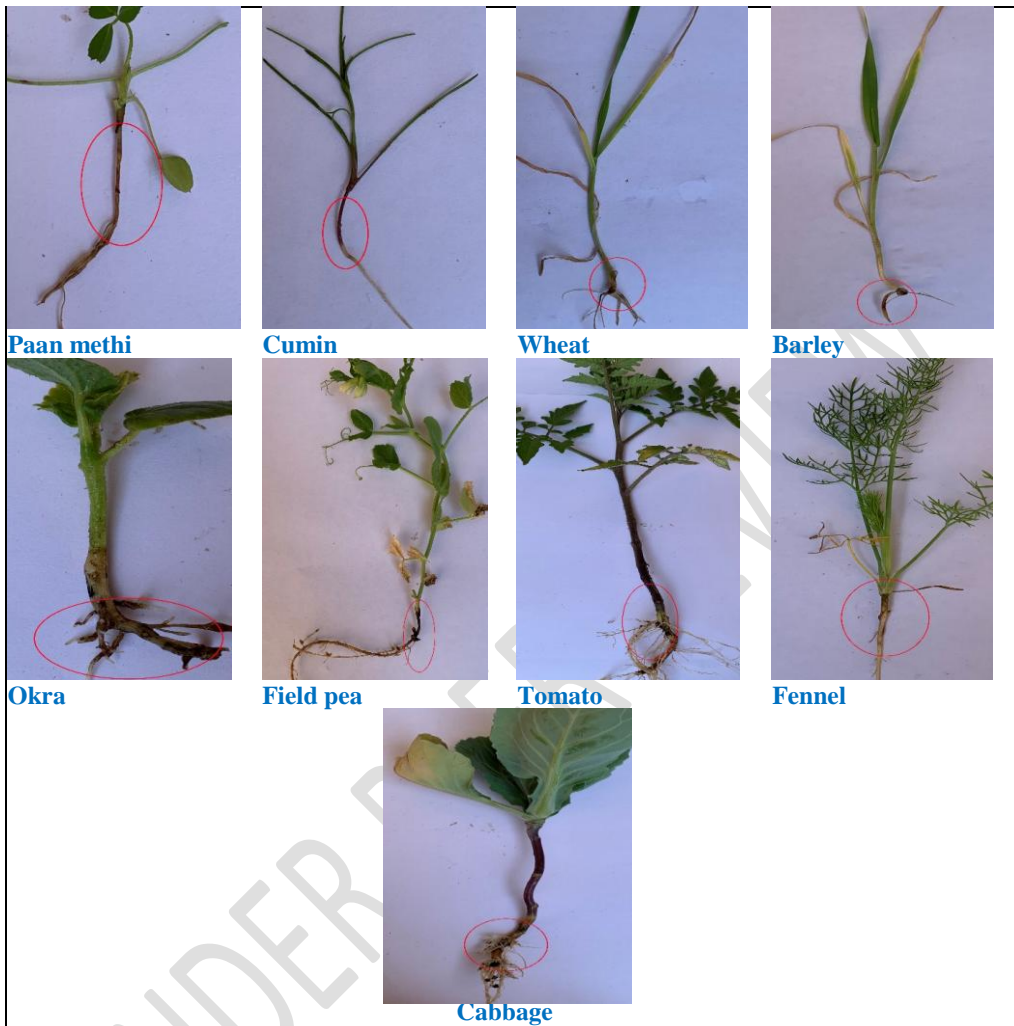
Plate 1. Reaction in different host plants to Rhizoctonia solani under artificial inoculation conditions during Rabi, 2022-23