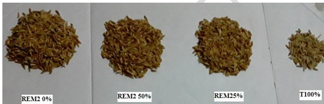
Figure 2. Image of paddy rice from the inoculation of the endophyte REM2 at the different nitrogen fertilizer level.

The highest increases in total grain yields were observed with DK4 (19%) and REM2 (22%). Figure 2, shows the results obtained with REM2: