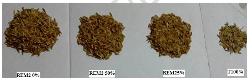
Figure 2. Image of paddy rice from the inoculation of the endophyte REM2 at the different nitrogen fertilizer level. The non-application and the application of fertilizer at 50% (F50) gave the best results for all parameters measured, except for the one thousand grain weight (1000 GW) compared to the non-application of nitrogen fertilizer (Table 5).

The highest increases in total grain yields were observed with DK4 (19%) and REM2 (22%). Figure 2, shows the results obtained with REM2: