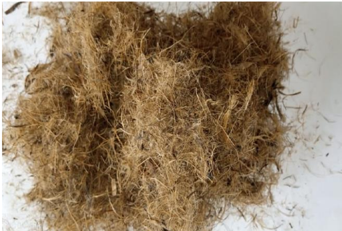
Fig. 2. Photograph of palm fibre used

The Palm fibre (PF) used for this research is the mesocarp of oil palm fruits (palm fruit bunch). It was obtained from oil palm processing mills at Ogbogbo town in Idah, Kogi state. The fibre was washed with warm water to remove oil and dirt, and sun-dried before it was used. Figure 2 shows a photograph of the palm fibre used. Some of the physical and mechanical properties of the palm fibre used are presented in Table 3.