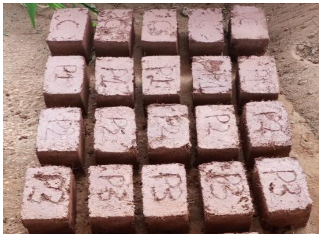
Fig.3. Photograph showing freshly moulded block specimen