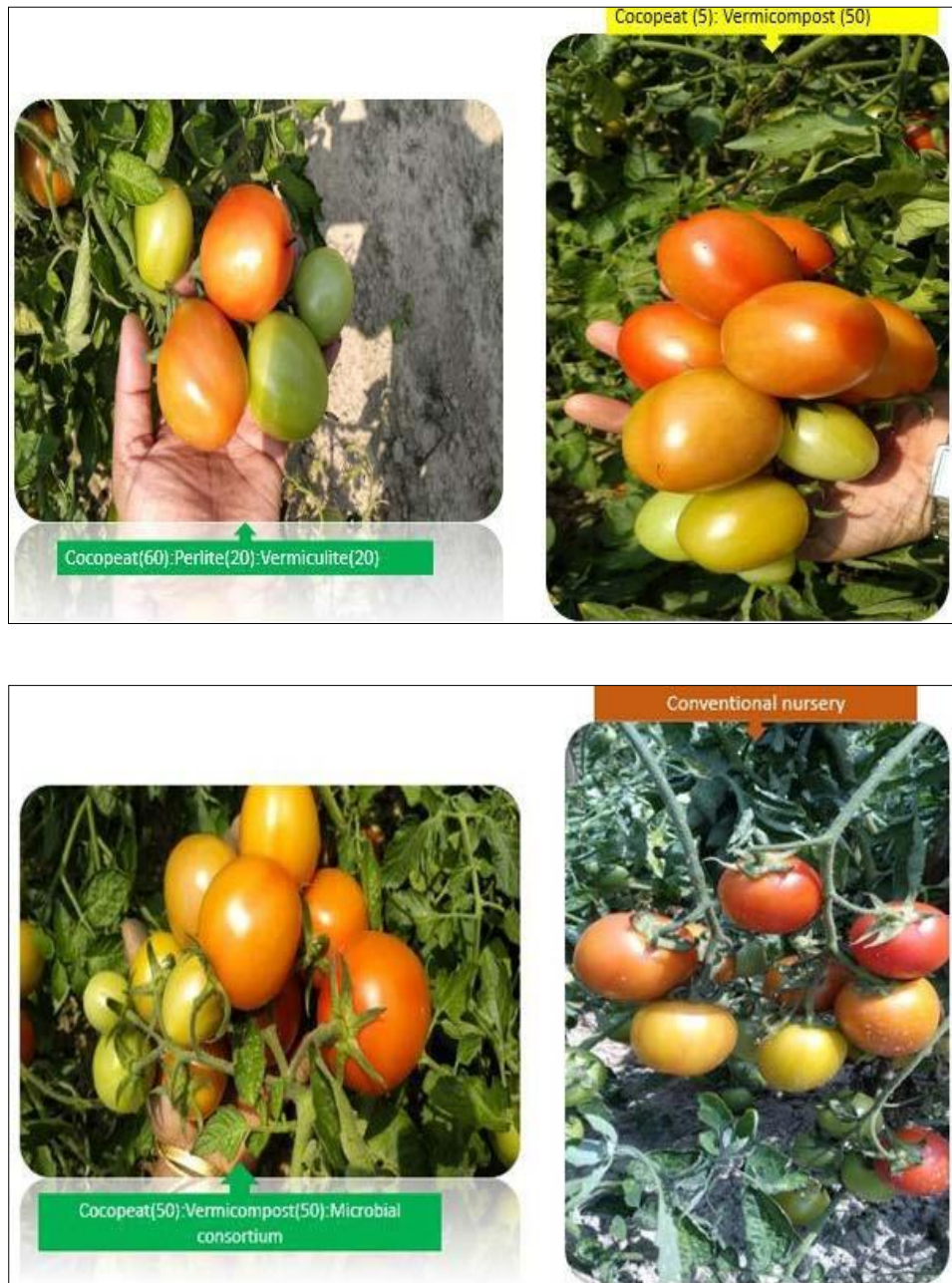
Fig. 3. Tomato Fruit cluster under different treatments