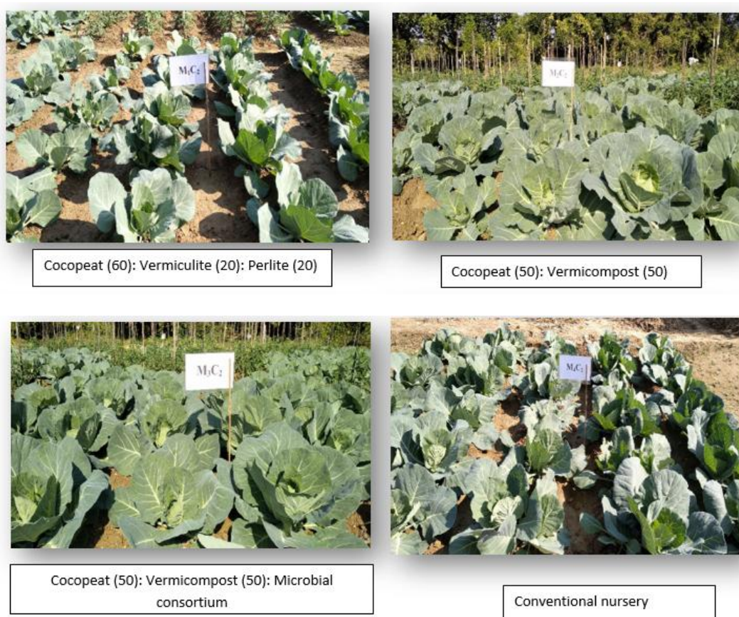
Fig. 5. Cabbage at vegetative stage under different treatment