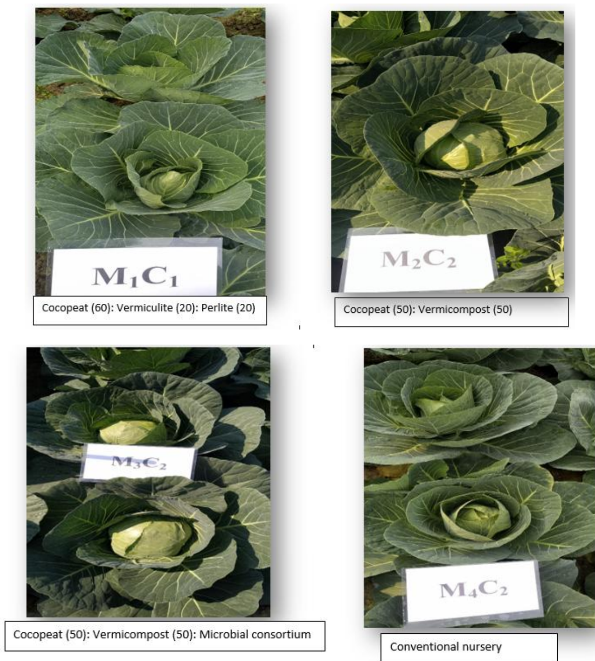
Fig. 4. Cabbage at head initiation stage under different treatments