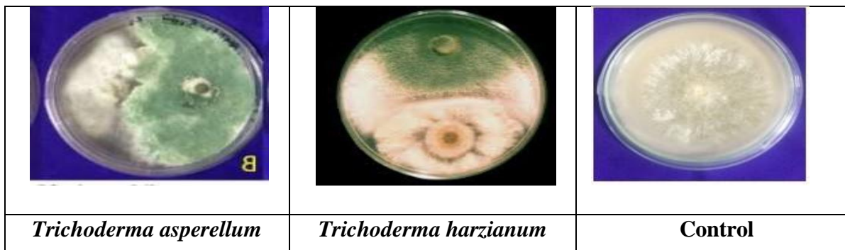
Plate: 2. Response of bio-agents against R. solani on mycelial growth.