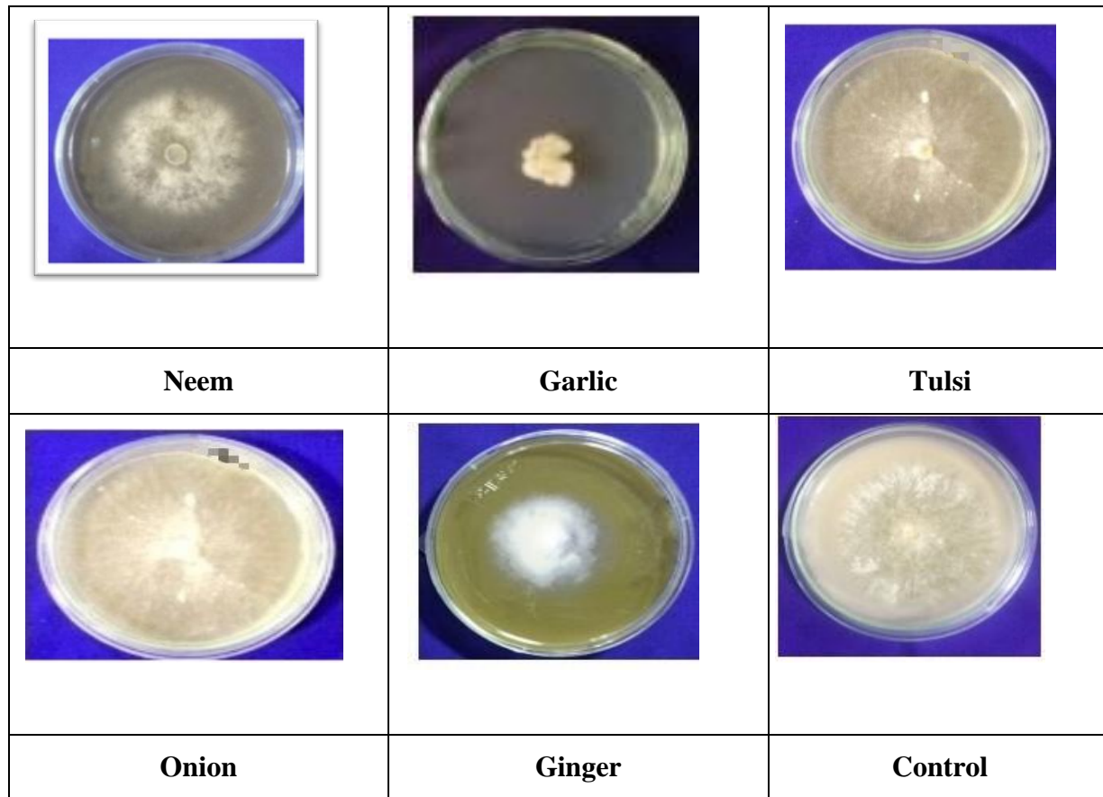
Plate: 1. Response of botanicals against R. solani on mycelial growth.