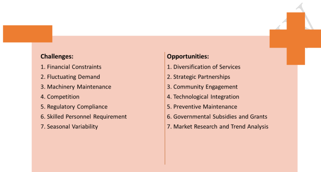
Figure 3. Challenges and Opportunities of CHCs

interspersed with off-season lulls. Another critical dimension entails the maintenance and upkeep of machinery, necessitating regular and often financially onerous maintenance to ensure optimal working conditions. With the burgeoning concept of Custom Hiring Centers, many regions are witnessing a surge of these centers, engendering stiff competition. Furthermore, navigating through the complex maze of evolving legal and regulatory standards presents a daunting challenge. Efficient operation of machinery also necessitates skilled personnel, underlining the imperative for regular training and skill development endeavors.