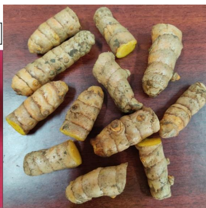
Fig. 2 Turmeric seed rhizomes

Size of the turmeric rhizome varies with moisture content. Moisture content of the turmeric rhizome decreases on the passage of time from the time of harvest. The moisture content of seed rhizome during sowing season is varied between 20-25 per cent. Geometrical properties like length, breadth and thickness decreases with decrease in moisture content of the rhizome. Generally, turmeric crop is harvested in F ebruary and M arch whereas plantation takes place in the period of J une to A ugust.