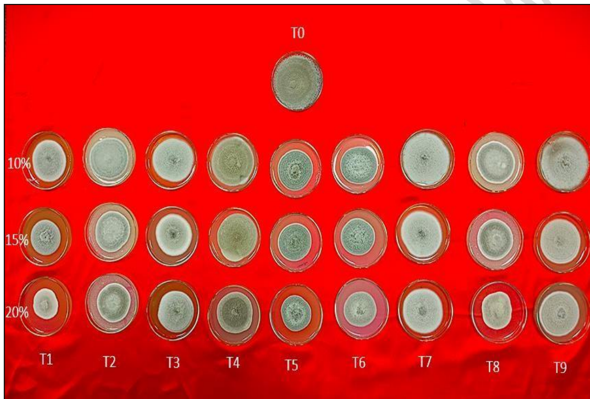
Fig 1: In vitro evaluation of botanicals against A. alternata

T 0 : Control, T 1 : Ginger, T 2 : Garlic, T 3 : Lantana, T 4 : Guava, T 5 : Onion, T 6 : Neem, T 7 : Moringa, T 8 : Lemon grass, T 9 : Bougainvillea