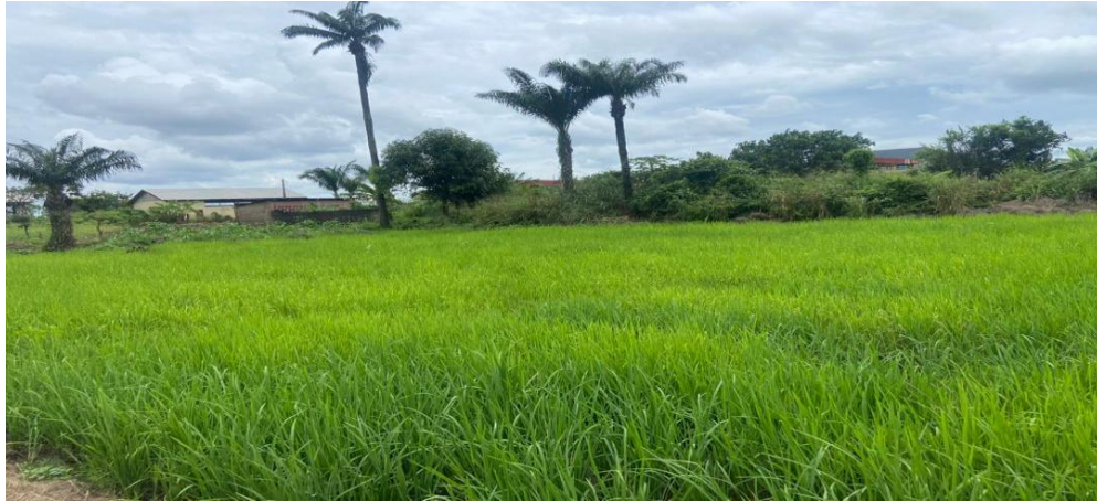
Plate 1: Experimental Site 1

site 2- 2. 7°7'10.344" E, 6°15'4.443" N using a portable global positioning system / GPS (GARMIN-etrex SUMMIT), starting from September to November, 2022. The rice farm in site 1 covered a land area of 200m 2 and site 2 covered a land area of 250m 2 respectively. The researcher used random sampling method to directly observe and collect insects from the rice fields. Sampling was done three times a week at each site. Sampling of each site was done from 8am-9am in the morning and 4pm -5pm in the evening.