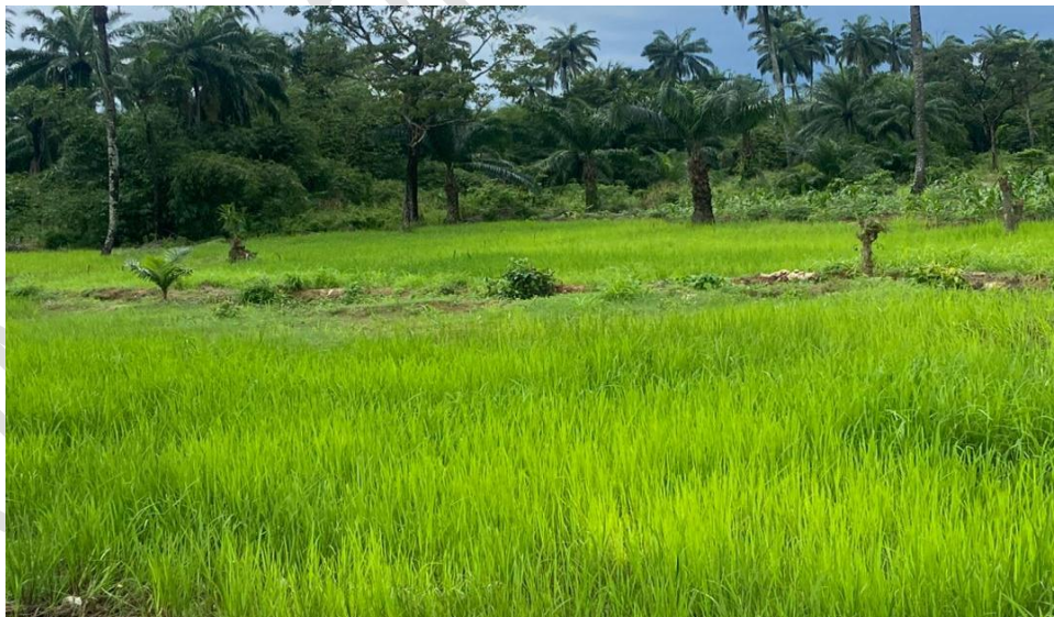
Plate 2: Experimental Site 2