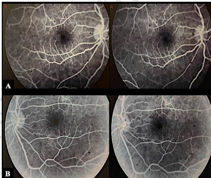
Figure 2 (A: Right eye, B: Left eye): Fluorescein angiography photography showing normal filling of the choroidal and retinal vessels, an unremarkable parafoveal capillary network and no fluorescein leakage on the late angiograms phases.