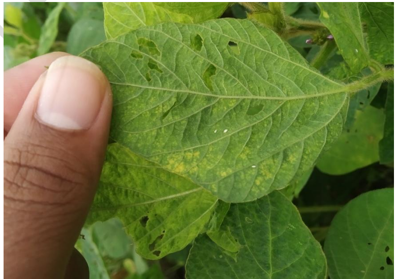
Plate 1: Yellow Mosaic Diseased plant and White fly feeding on Soybean.