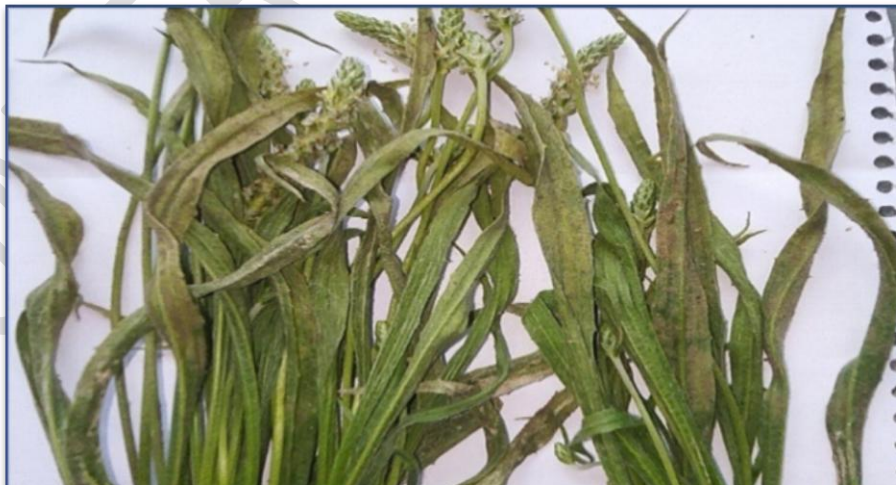
Figure 2. Downy mildew infected leaves of Isabgol.