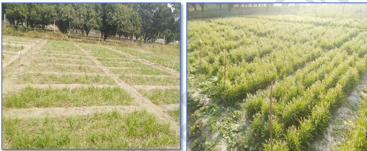
Figure 1. Screening of Isabgol genotypes against downy mildew disease.

The data collected during the study, were subjected to the statistical analysis by adopting 'Analysis of variance' techniques as described by Panse and Sukhatme[10].