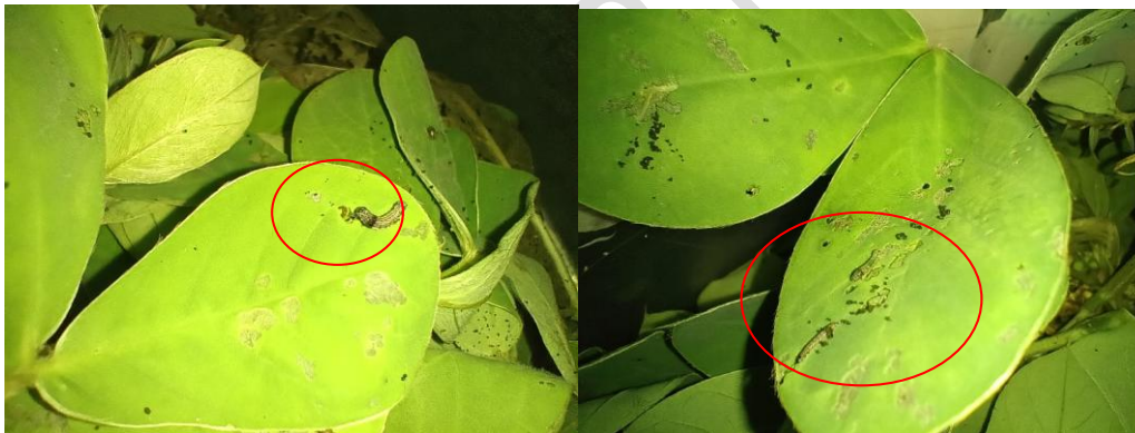
Plate 3: Feeding reconfirmation study, Early instars of S. litura larvae feeding on young leaves of Cassia tora (top left); Symptoms feeding damage by S. litura (top right); Grown up second instar larvae of S. litura on Cassia tora (bottom left); Feeding larvae of S. litura and its excreta on Cassia tora

Comment [9]: The correct term is Figure, It is necessary to renumberate all figures