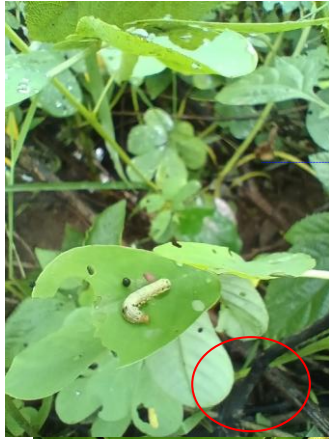
Spodoptera litura on Cassia tora , showing both final instar larvae and early larva feeding on Cassia tora and their feeding symptoms during field

Comment [8]: The correct term is Figure, It is necessary to renumberate all figures