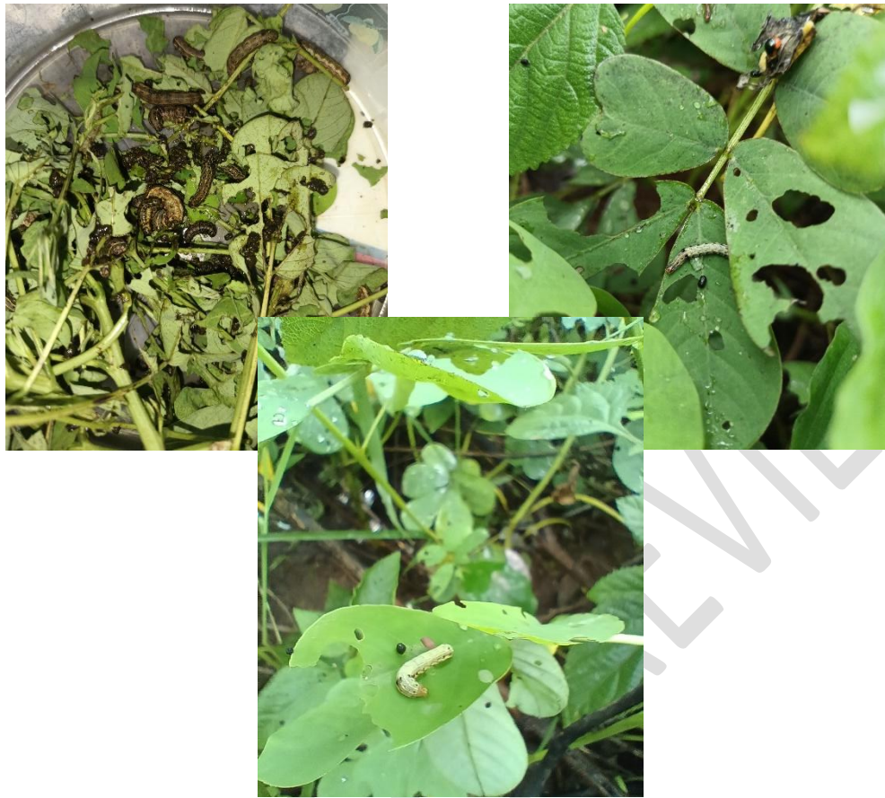
Plate 2: Laboratory reared Spodoptera litura on Cassia tora , showing both final instar larvae and prepupal stages (left); S. litura larva feeding on Cassia tora and their feeding symptoms during field visit (middle and left)