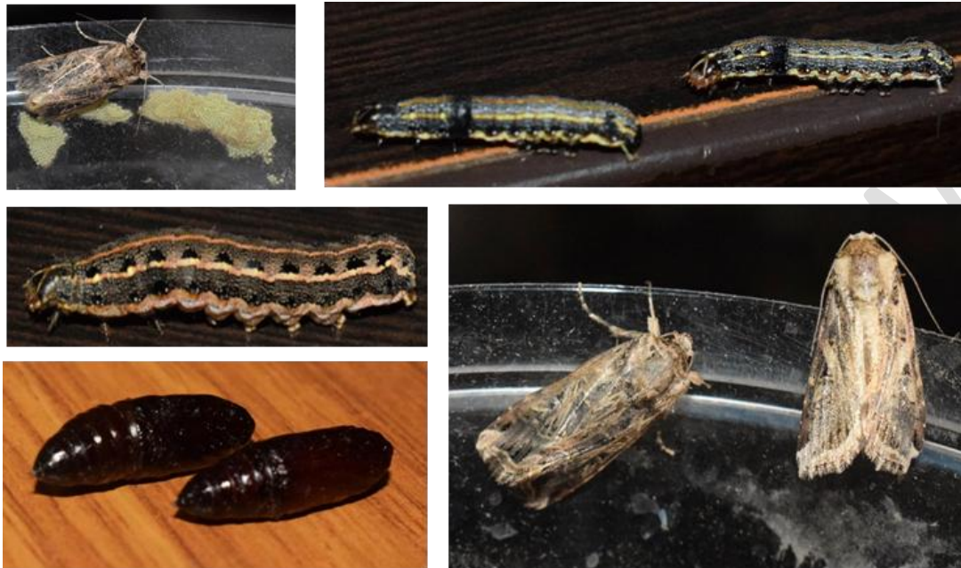
Plate 1. Different life stages of Spodoptera litura

Adult: The body was a grey-brown in colour. The forewings were patterned with dark gray and brown colours. The hindwings are greyish-white with a gray outline. The orbicular spot on the forewing was also more pronounced in the males.