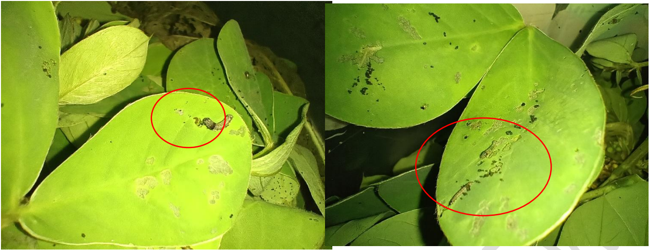
Plate 3: Feeding reconfirmation study, Early instars of S. litura larvae feeding on young leaves of Cassia tora (top left); Symptoms feeding damage by S. litura (top right); Grown up second instar larvae of S. litura on Cassia tora (bottom left); Feeding larvae of S. litura and its excreta on Cassia tora