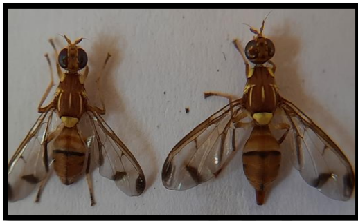
Fig.1 a) Fruit fly (Male and Female)

A total of 50 pupae were maintained under observation, and their color gradually changed from light cream to dark brownish. Eight of the pupae turned out to be parasitoid. In the last week of October, it was discovered that 16% of the population was parasitized. This process was conducted twice to ensure the associated parasitoid. The emerged parasitoids was confirmed as Psytalia fletcheri (Silvestri) Fig.1 b It was a larval pupal parasitoid, it lay egg on the larvae of melon fly and emerged as an adult from pupae.