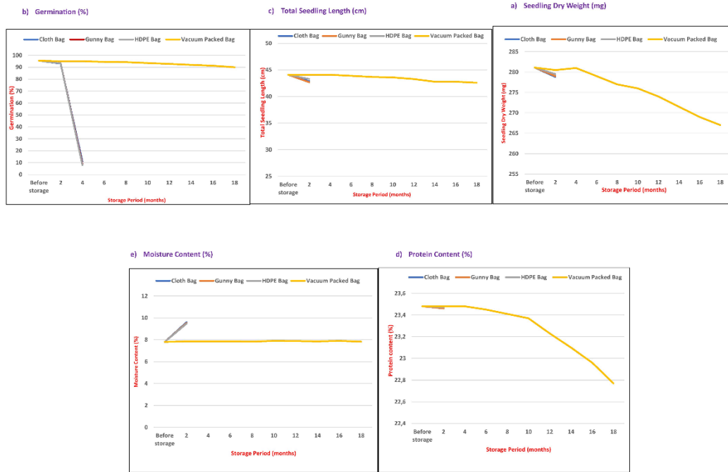
Fig.3. Germination (%), Total seedling length (cm), Seedling dry weight (mg), Moisture content (%) and Protein content (%) of moth bean seeds as influenced by different packaging at different time intervals of storage

Note: Observations in cloth, gunny, and HDPE bag treatments have been discontinued as a result of bruchid infestation after 4 months of storage