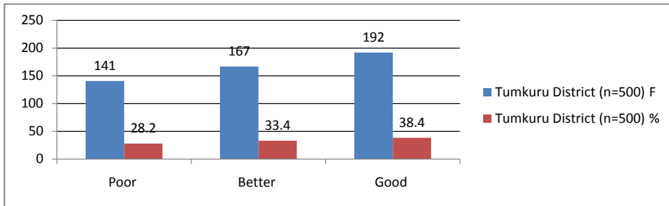
Fig 1:Overall Perception of Farm Women regarding Entrepreneurial Development in Tumkuru district

It is seen from the table 4 that, 38.40 per cent of the respondents had good perception of farm women regarding entrepreneurial development, 33.40 and 28.20 per cent of the respondents had better and poor perception of farm women regarding entrepreneurial development in Tumkuru district. The probable reason for the above findings that, since the major portion of the perception of farm women are interested to start a new enterprise and they are ready to build entrepreneurial development activities. These findings are in line with the results of Sidram (2015).