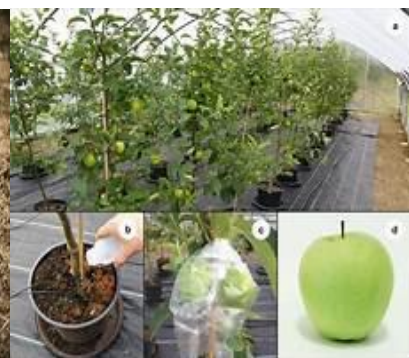
Fig. 6 Greenhouse