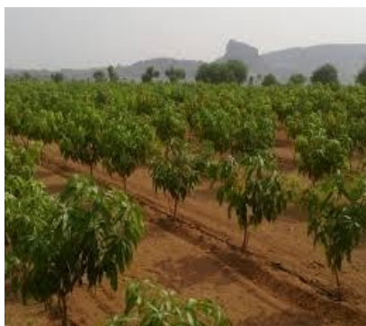
Fig. 1 High density planting

High density planting, integrated nutrient management based on soil and leaf analysis, micro-irrigation, fertigation, adequate integrated pest, disease, and weed control, appropriate mechanisation, and crucial advances like pre-harvest bagging use are all included in these systems. The situation of fruit crops including bananas, pineapples ( Ananas comosus ), and grapes ( Vitis vinifera ) in India has changed as a result of high-tech technologies. The different types of Hi-Tech farming techniques adopted in fruit crops are as follows