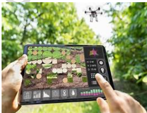
Fig. 7 Precision farming