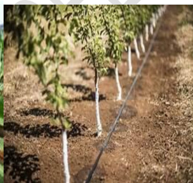
.Fig. 5 Micro-irrigation