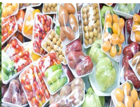
Fig. 8 Post harvest management