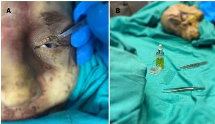
Figure 1: Microscopic examination protocol of samples.

A: taking the eyelash sample from the upper eyelid, B: placing the sample on