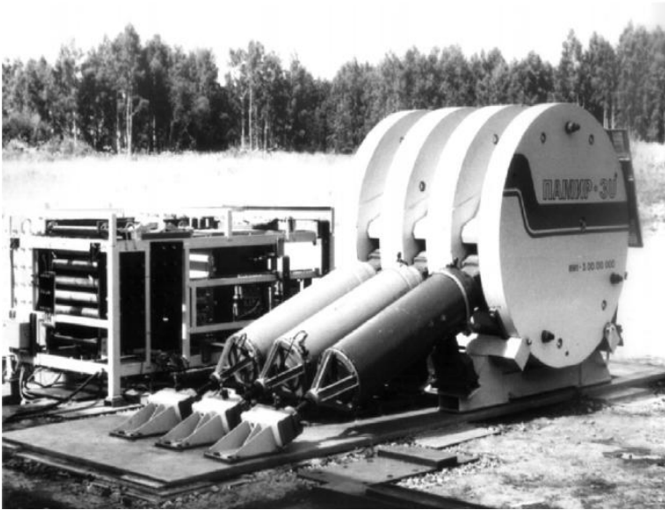
Figure 5: Pamir-3U MHD system [56, 57].