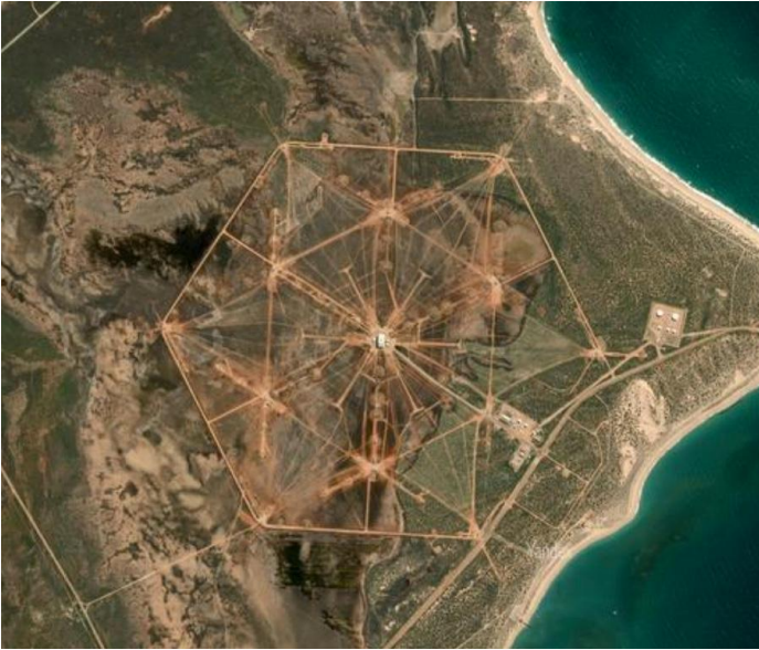
Figure 3: Australia, powerful VLF transmitter (North West Cape (NWC) transmitter : Naval Communication Station Harold E. Holt) [45].

Among all the instruments that send electromagnetic waves into the ionosphere to study it, there are :