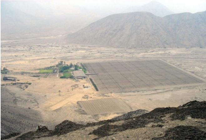
Figure 1: JRO (Peru) [25].

In the world there are other IHS: Russia (SURA) operates between 4.5 to 9.3 MHz with a PP of 750 kilowatts (750 kW) and an ERP of 190 MW; Norway (EISCAT), 3.85 to 8 MHz, PP of 1.2 MW and ERP of 1.2 GW; Peru (JRO), 50 MHz with a PP of 6 MW (Fig 1, 4) [25]. IHS can propagate their HF beams over very long distances, for example from Norway to Antarctica [26].