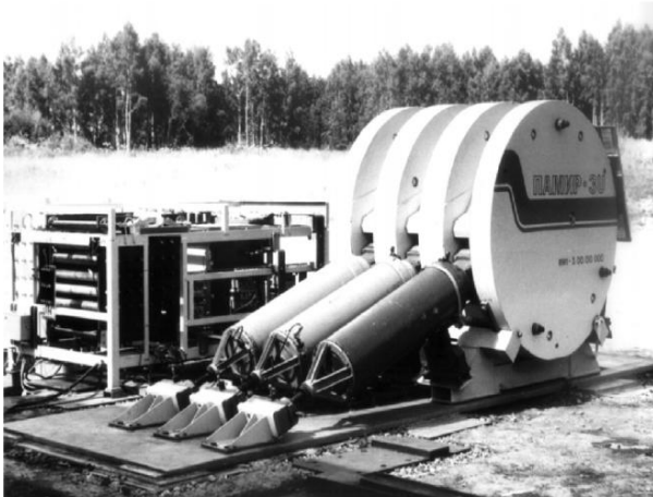
Figure 5: Pamir-3U MHD system [56, 57].