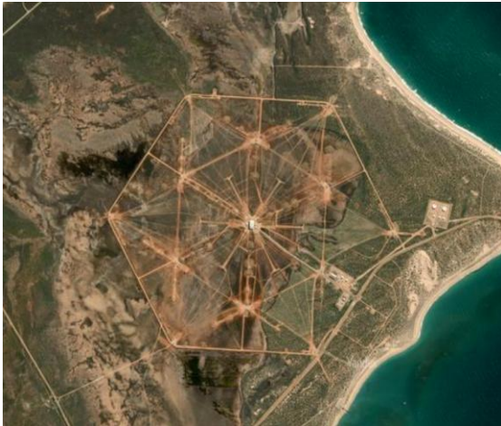
Figure 3: Australia, powerful VLF transmitter (North West Cape (NWC) transmitter : Naval Communication Station Harold E. Holt) [45].

Among all the instruments that send electromagnetic waves into the ionosphere to study it, there are :