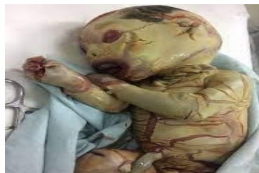
Figure 1- Appearance of Harlequin ichthyosis

Harlequin ichthyosis, an exceptionally rare and severe genetic skin disorder, stands as a poignant example of the intricate relationship between genetics, skin biology, and clinical manifestation. This congenital condition belongs to the broader spectrum of ichthyoses, a group of hereditary skin disorders characterized by aberrant scaling and thickening of the skin. Harlequin ichthyosis, in particular, represents one of the most severe and visually distinctive forms within this spectrum, captivating the attention of researchers, clinicians, and the medical community as a whole. With an estimated incidence of just one in several hundred thousand births, Harlequin ichthyosis remains a medically and genetically intriguing anomaly. This disorder's origin lies in a genetic mutation affecting the ABCA12 gene, crucial for the formation of the skin barrier. Mutations in this gene lead to a deficient production of the lipid transporter ABCA12, which is pivotal in the complex process of skin development and maintenance. (1,2)